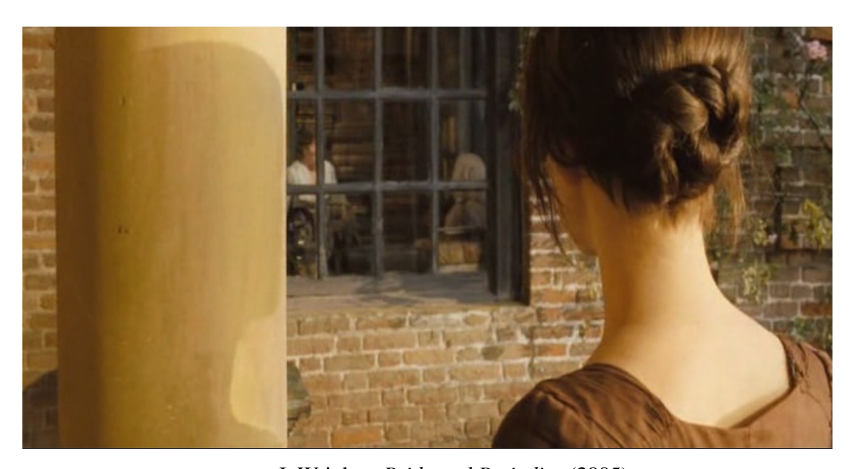
J. Wright – Pride and Prejudice (2005)

introduces the viewer to the other sisters, a dog, and a cheerful clutter of mostly womanly objects. Finally, the camera goes out and finds Elizabeth again, as she stops to watch her parents through a windowpane and from the foot of an external staircase.