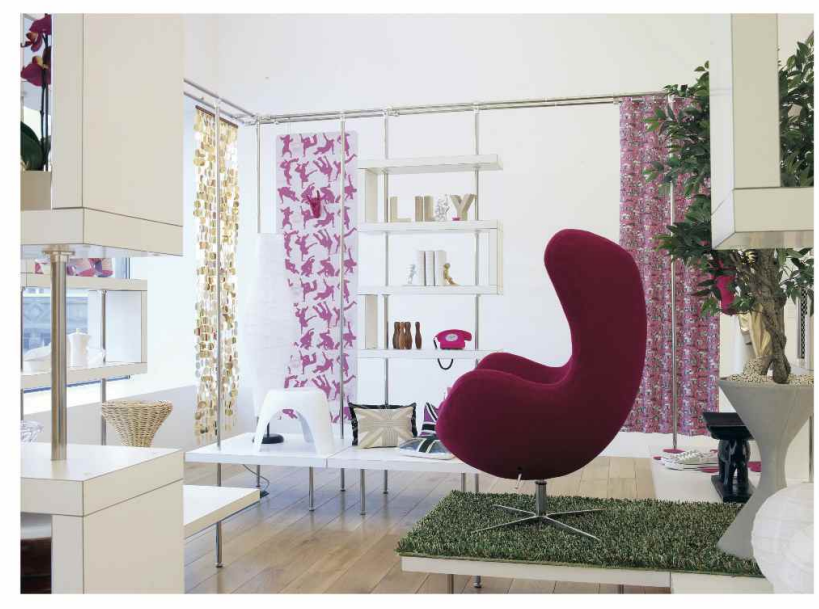
Matthew Darbyshire An Exhibition for Modern Living 2010 Mixed media

Such speculations might seem mean-spirited, but the alternative is to ascribe to the British Art Show a sort of a sincere democratic optimism about its missionary activities. Well, the products in An Exhibition for Modern Living are full of optimism – they're cheerful, affordable, patriotically inscribed with sparkly Union Jacks. They're also dismal. If this is democratic optimism, Darbyshire suggests, perhaps it would be a good thing if curators did have at least a measure of elitist pessimism about Nottingham, Glasgow and Plymouth. Or at least he seems to suggest that. The installation itself, again, is too deadpan to take any position of its own – it's just stuff on some shelves – and all the wrangling above is outsourced to the reluctant Drains of its visitors. When BAS7 moves to the metropolitan surroundings of London's Hayward Gallery in February, many of these themes will inevitably fade from view, and that's something to regret, because An Exhibition for Modern Living subjects the survey to the sort of ideological stress tests that you won't find anywhere in the catalogue.