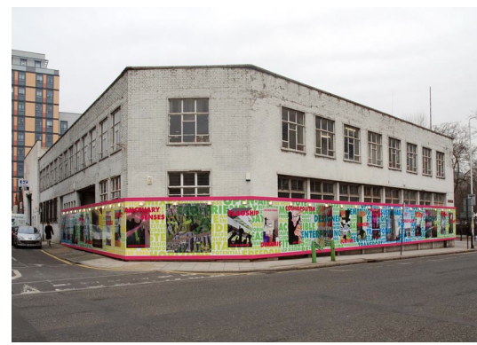
Elis, Herald Street 2010