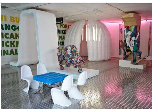
Funhouse, Hayward Project Space 2009