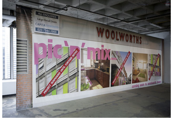
Woolworth Tower, Zabludowicz Collection 2011