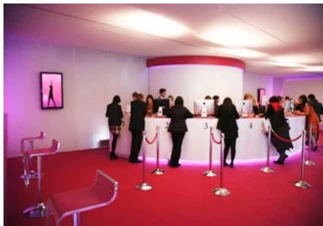
Everything Everywhere, Frieze Projects 2010