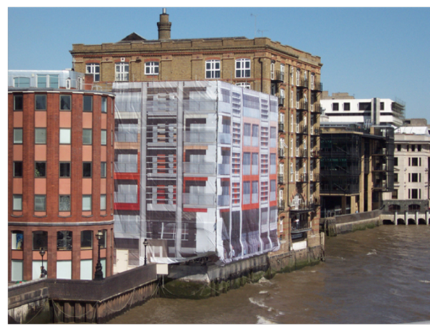
Some examples of existing building wraps in London and Glasgow.

My proposal for the hoarding commission would assume the form of a typical building-wrap, occupying the entire left-side of Kettles Yard Castle Street entrance whilst renovation works for the new education wing take place. Depicted on the perforated building-wrap would be a fictitious "coming soon" development under the current working title ukfun-ky .