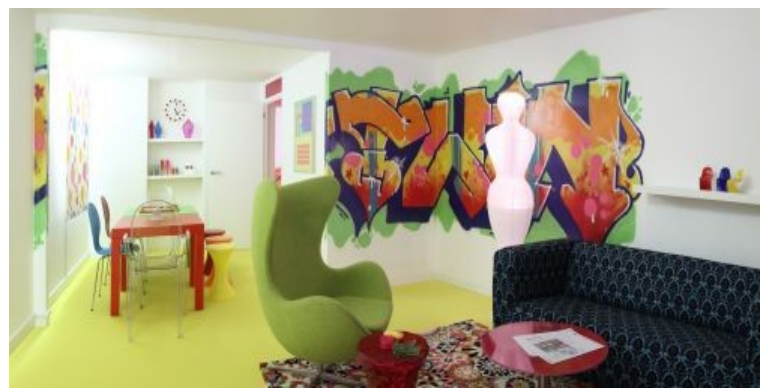
Blades House, Gasworks 2008