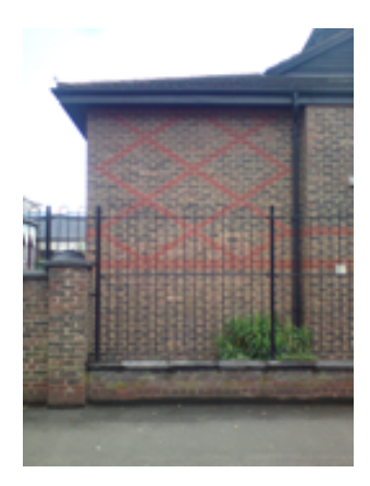
Various examples of developers vernacular - some built in the early 1980's and some in the last two years.

Alongside mock tudor beams, meaningless patterns in brickwork, bare breeze blocks pretending to be sandstone, ugly oversized pvcu porticos, plastic pediments, faux-lead roof flashings, mock steeples, high paranoiac parameter railings, bulbous romanesque cast-concrete columns, token miniature gardens out front, faux obelisks on either side of entranceways etc. we'll no doubt also continue to see one or two of the sturdier remnants of the new labour legacy such as the tokenistic cedar clad thrown here and there to tick the 'sustainable' box; the randomized geometry in the hermetically sealed and unopenable window panes that wink at modernisms socialist convictions whilst of course not over-committing; the light-hearted pop-feel aspects introduced by Alsop, Urban Splash et al to distract from the dubious financial structures beneath them; the incompetent design and the ultimate dysfunction of what ever it was they were permitted to build on behalf of the government; and the symbol of the phoenix of course being reborn from the flames and regenerating all in its path through impotent outreach initiatives executed by service providers up and down the country.