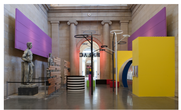
Palac, Tate Britain 2008