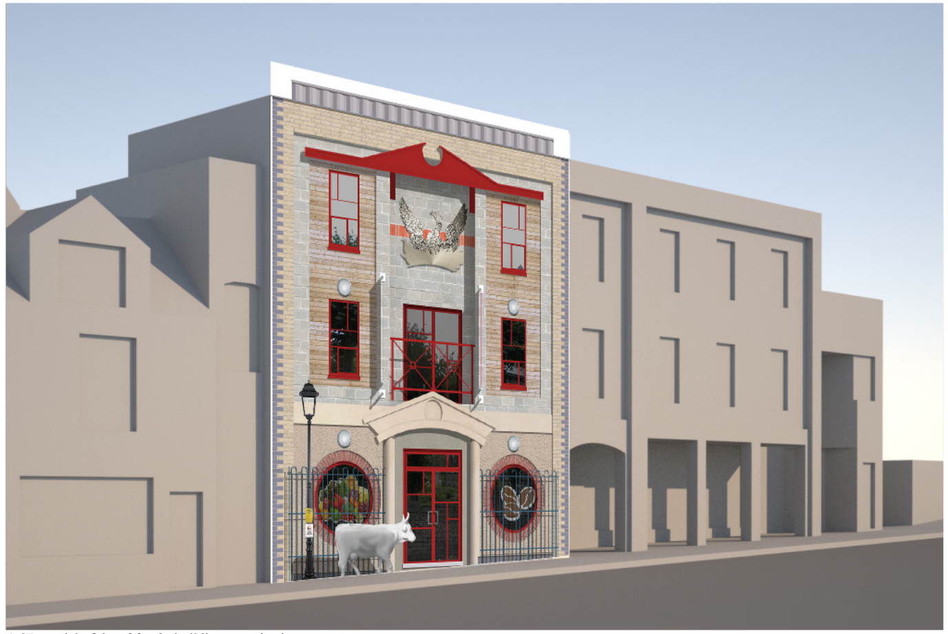
A 3D model of the ukfun-ky building wrap in situ.