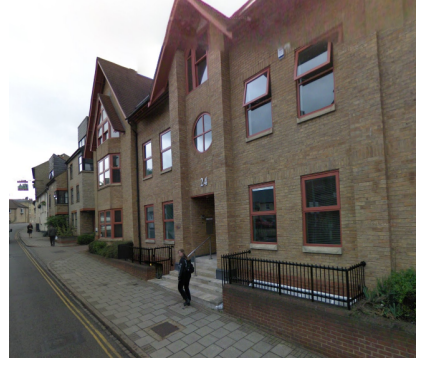
Some examples of the more abject yet pervasive identikit housing around the Kettles Yard area.

ukfun-ky calls to mind the regrettable mistakes of the 1980's and evokes fear at the potential replacement of an institution as auspicious as Kettles Yard with a One Stop Shop style mixed-use cultural hub with adjacent Costa Coffee and Tesco Express style concessions. By doing this ukfun-ky wants to talk of the thoughtless and insensitive developments we saw in the Eighties incentivised only by profit, and through it's uncomfortable plausibility wants to remind us just how close we are to a revival.