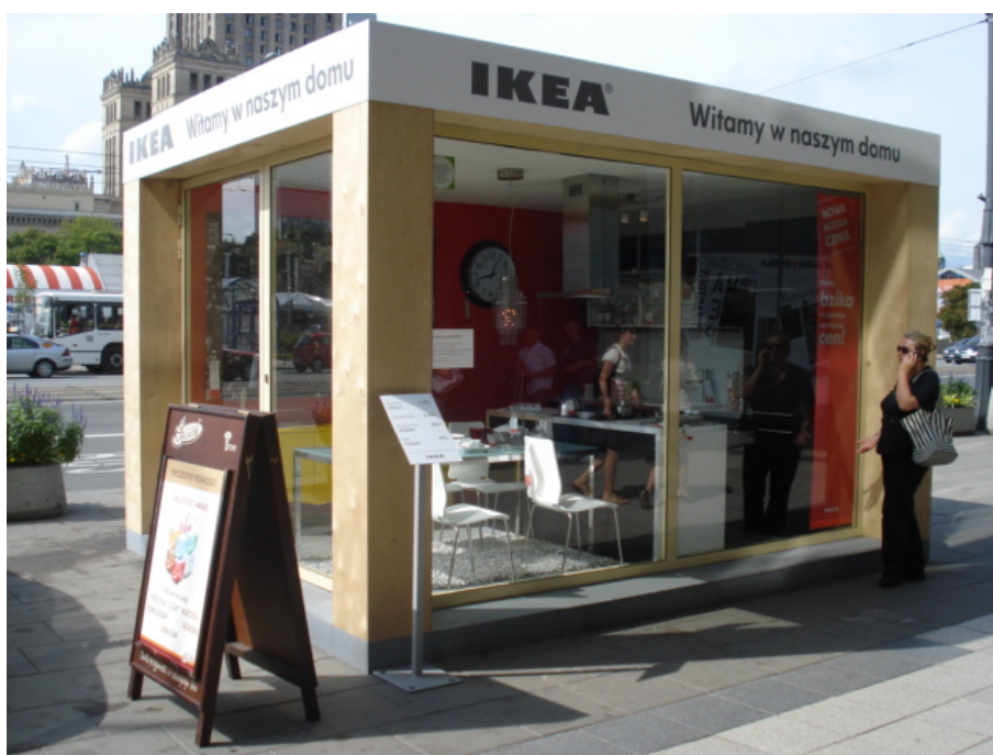
Ikea pop-up showroom, Warsaw, Poland 2012

This is why I am wanting to create something chameleonic - something indefinable and in fact confusing in it's seemingly unremarkable, shape-shifting and polymorphous appearance. I want to create a space that doesn't stake it's claim nor it's function, a space that could almost go unnoticed and even upon entry leaves the participant confused as to what is expected from them or it.