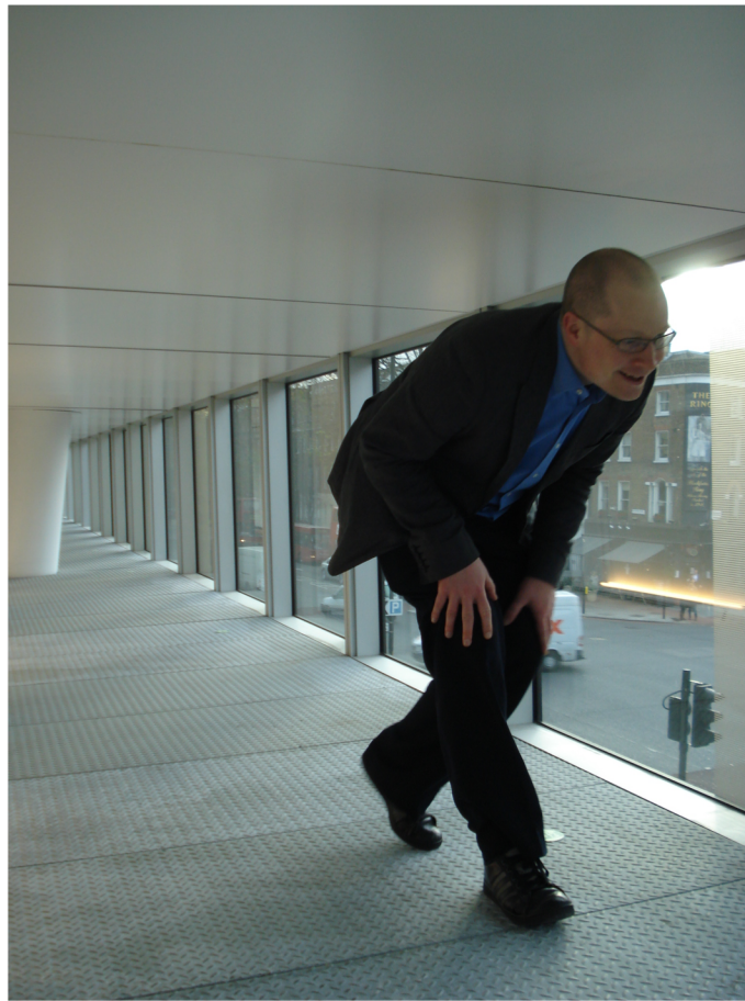
A functionless space within Will Alsops Palestra , Transport for London headquarters, London 2012

"I have several times tried to think of a useless room, absolutely and intentionally useless. It wouldn't be a junkroom, it wouldn't be an extra bedroom, or a corridor, or a cubby-hole, or a corner. It would be a functionless space. It would serve for nothing, relate to nothing.