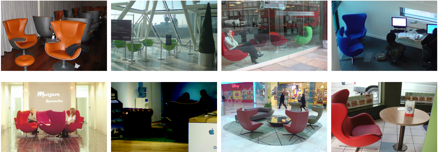
(from top left) Some examples of the most ubiquitous design initiatives as evidenced in Eurostar Lounge, Paris; Excel Arena, London; Foxtons Estate Agents, Manchester; Sheffield Hallam Library, Sheffield; Monsoon HQ, London; Vodafone shop, Birmingham; Westfield Shopping Centre, London and Mc Donalds restaurant, Leeds.

Over the past few years my artistic activities have been centered around a fascination with the non-specificity of the design of our built environment. Whether this be as a result of increased privatization, economic agendas, material technologies, health and safety restrictions, building regulations, fashion and taste preferences, functional requirements or changing behavioral characteristics, and whether or not this is something you welcome or refute, one can certainly not deny that our built environment is becoming more and more homogenous as it melds in to one and becomes increasingly difficult to differentiate a library from a leisure centre and a museum from a mall.