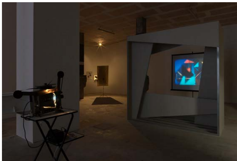
Fig. 3: David Maljković, Images with their own shadow , 2008. 16mm film installation. Courtesy the Artist, Annet Gelink Gallery Amsterdam, Georg Kargl Fine Arts, Vienna, Metro Pictures, New York, Sprueth Magers, Berlin London.