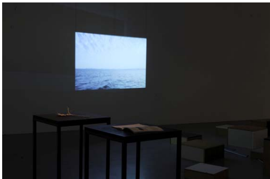
Fig. 8: Fokus grupa, A Proposal for the Monument to the New (Inter)Nationalism (installation detail), 2012. Courtesy of the artists

inspired by songs that bear actual national significance, is exhausted in its symbolical meaning, as it is, alluding to the continuity of national statehood in a period that did not even know the idea of nation, void of all content in the present context, or even for the times when the national coat of arms was designed.