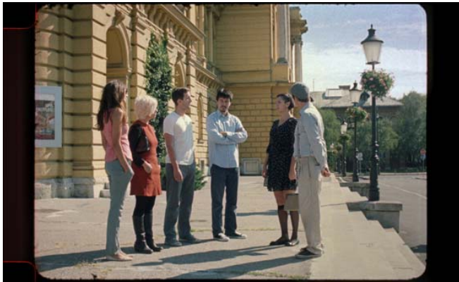
Fig. 6, 7: Ana Hušman, Postcards , 2013. film stills.