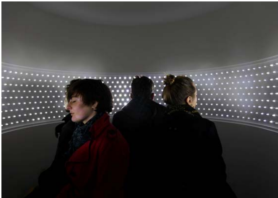
Fig. 2: Ivana Franke, When we close our eyes we see a flock of birds , 2013. Courtesy of the artist.