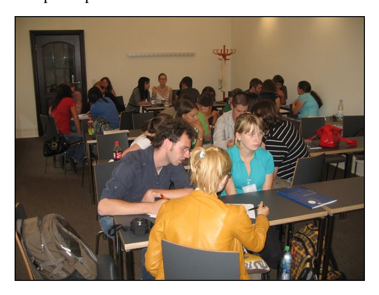
Working in international topic teams

Composing international teams of students also enhanced the development of language and social networking skills. Since English was not the students' mother tongue, the IPBib 2009 also worked as a very intensive English course and the students could extend their Library and Information services related vocabulary in English. Apart from gaining knowledge in Library and Information Studies, the exposure to sometimes very different cultural and educational backgrounds was a tremendous enrichment for the future and resulted in stimulating professional and personal partnerships which lead to a creation of international and interdisciplinary networks on the level of academic studies and education. Plus the multiple methodological character of the whole programme improved the communication and presentation skills of all participants.