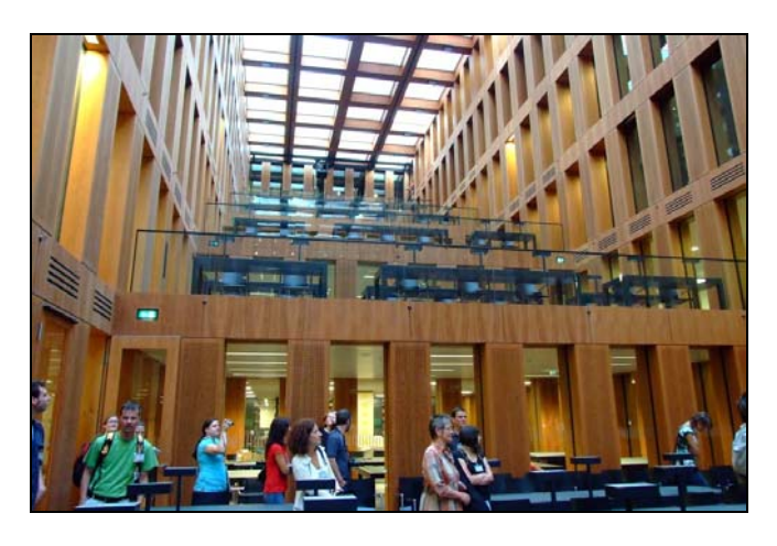
Jacob-und-Wilhelm-Grimm-Zentrum: central University Library and Computer and Media Centre of Humboldt University

After welcoming the students and lecturers the official start of the IPBib 2009 was a breakfast on September 2<sup>nd</sup> which was followed by a guided tour through the new building hosting the University Library and the Computer and Media Centre of Humboldt University which was at that time not yet open to the public. The name of the new building Jacob-und-Wilhelm-Grimm-Zentrum reminds of the famous intellectuals, researchers and authors Jacob and Wilhelm Grimm the so called Brothers Grimm. The Grimm-Zentrum was supposed to be the centre, the heart of the IPBib 2009.