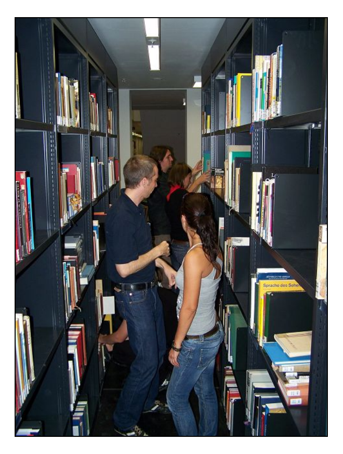
Practical work in Grimm-Zentrum