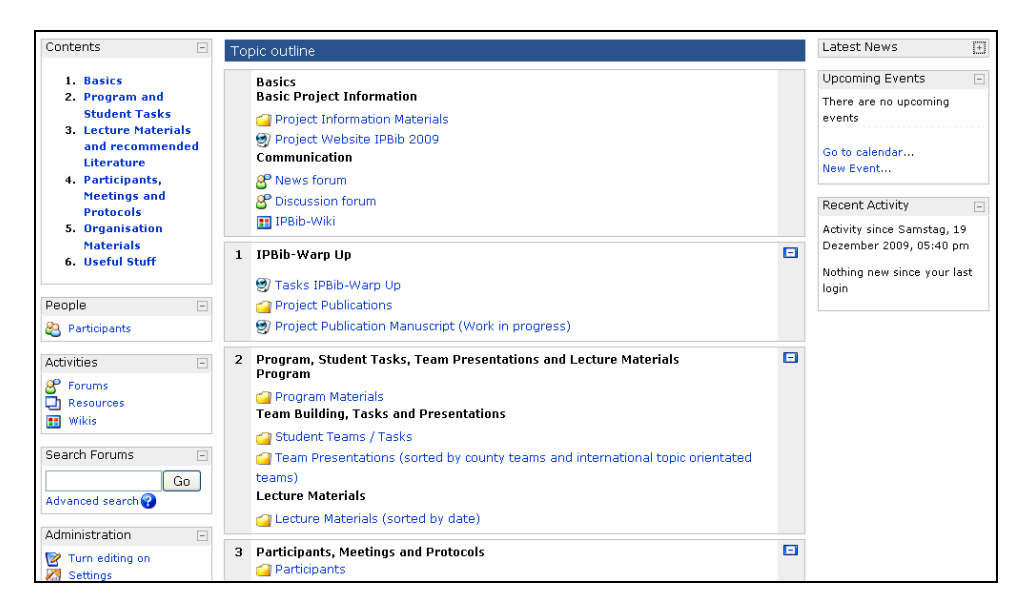
IPBib 2009 Moodle course

From the very start of the project on the organisers wanted to make sure that the whole programme is documented as transparently as possible and thus offers the interested public insight in the project conception and project work also after the project finished. So a bilingual project website was launched immediately and embedded into the website of the Berlin School: <a href="http://www.ibi.hu-berlin.de/ipbib/">http://www.ibi.hu-berlin.de/ipbib/</a>. It shows detailed project description, programme information, project news and other useful information. A picture gallery was set up to reflect the project work visually and, there is an area for publications, too. In the course of an evaluation of the project more documents, freely accessible, were added. The official project report, project videos, an article to the university magazine Humboldt and a contribution to the high-circulation Library Science journal BuB: the IPBib 2009 has always strived to promulgate its activities to the public. Thus only very short time after the end of the project the IPBib 2009 was presented at the Frankfurt Book Fair 2009. Other activities, such as participations in international conferences, besides the BOBCATSSS Symposia, for example the upcoming IFLA Main Conference, are planned.