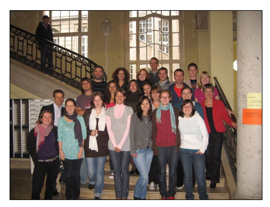
IPBib 2009 participants in Berlin

The call for students on national and international level was a very interesting experience because the final group resulted in being rather heterogeneous. German, Czech and Lithuanian students came from different study programmes (Bachelor, Master, Magister), the Austrian students were already in a postgraduate Master programme, while all the Bulgarian students were students in a Bachelor programme. Altogether the final group consisted of seven students from Germany and 18 from abroad plus 12 lecturers from the five partner countries.