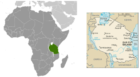
Maps taken from CIA – The World Factbook www.cia.gov