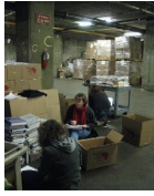
St. Kate's students at Books for Africa Warehouse